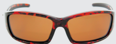
TORTOISE FRAME / AMBER GREEN HP107A-3