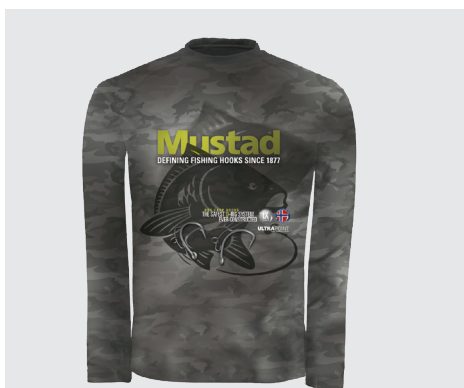
MCTS05 DAY PERFECT SHIRT BBS CAMO

Bass Sizes: XSS - XS - S - M - L - XL - XXL