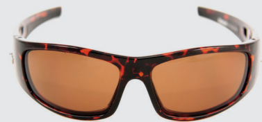
TORTOISE FRAME / AMBER LENS HP106A-3