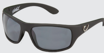
BLACK FRAME, SMOKE LENS HP100A-2