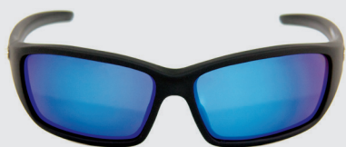
MATTE BLACK FRAME / SMOKE BLUE REVO LENS HP107A-1