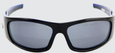
GLOSS BLACK BLUE CRYSTAL FRAME / SMOKE LENS HP106A-2