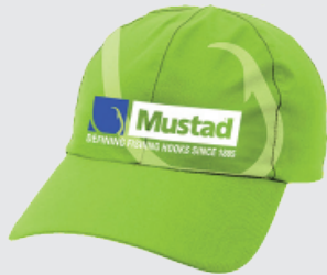
Green REF. MCAP01-GR