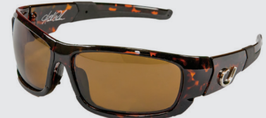
TORTOISE FRAME, AMBER LENS HP101A-3