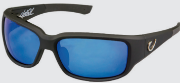
BLACK VENTED FRAME, SMOKE LENS WITH BLUE REVO HP102A-1