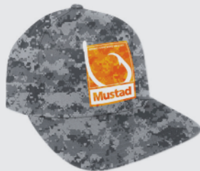
Digi camo MCAP04-SDC