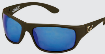
BLACK FRAME, SMOKE LENS WITH BLUE REVO HP100A-1