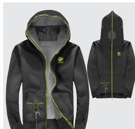
MCH03 SNOWMAN HOODY

MC01 Hoody (Blue) MC01 Kauji Hoody (Grey camo) Sizes: XS - S - M - L - XL - XXL