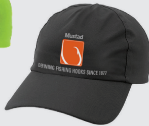
Black REF. MCAP01-BL