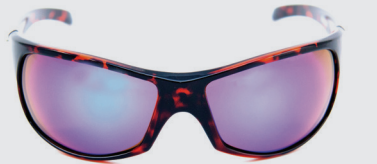
TORTOISE FRAME / AMBER GREEN REVO LENS HP103A-3