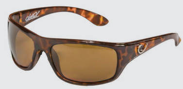
TORTOISE FRAME, AMBER LENS HP100A-3