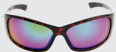
TORTOISE FRAME / AMBER GREEN REVO LENS HP104A-3