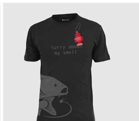
MCTEE01 SMELLY T-SHIRT

Mahi Tuna Sizes: XSS - XS - S - M - L - XL - XXL