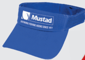
Blue REF. MCAP02-BU