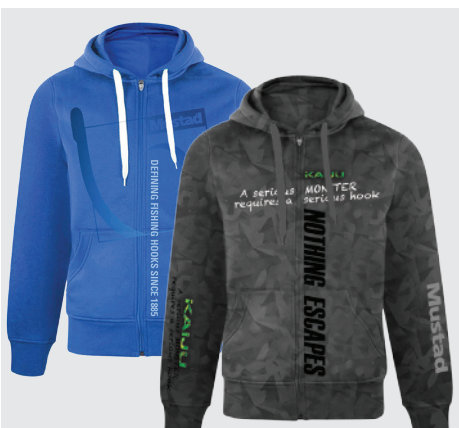
MCH01 - MCH02 HOODY

Gray - MCTEE02 Blue - MCTEE03 Sizes: XSS - XS - S - M - L - XL - XXL