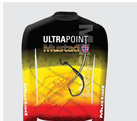
MCTS04 DAY PERFECT SHIRT

Tournament Blue Sizes: XSS - XS - S - M - L - XL - XXL