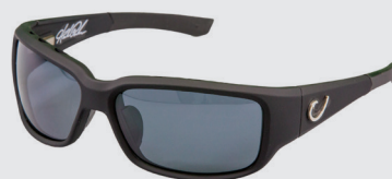
BLACK VENTED FRAME, SMOKE LENS HP102A-2