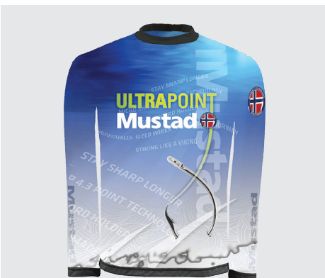
MCTS03 DAY PERFECT SHIRT

White Black Blue Sizes: XSS - XS - S - M - L - XL - XXL