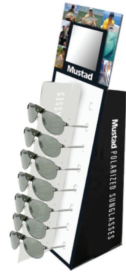
FREESTANDING SUNGLASSES DISPLAY M-DISPLAY-SG