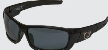
BLACK FRAME, SMOKE LENS HP101A-2