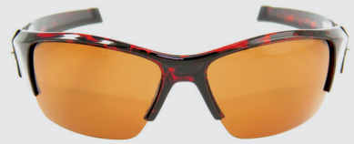
TORTOISE FRAME / AMBER LENS HP105A-3