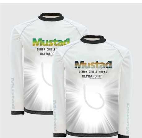
MCTS02 DAY PERFECT SHIRT

Camo Sizes: XSS - XS - S - M - L - XL - XXL