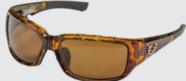
TORTOISE VENTED FRAME, AMBER LENS HP102A-3