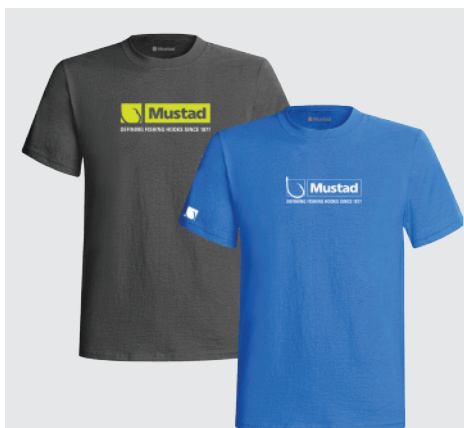
MCTEE02 - MCTEE03 MUSTAD T-SHIRT

Black Sizes: XSS - XS - S - M - L - XL - XXL