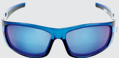
CRYSTAL BLUE FRAME / SMOKE BLUE REVO LENS HP106A-1