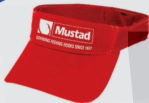
Red REF. MCAP02-RD