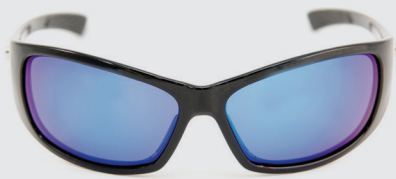
GLOSS BLACK FRAME / SMOKE BLUE REVO LENS HP104A-1