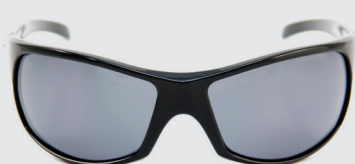
GLOSS BLACK FRAME / SMOKE LENS HP103A-2