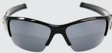
GLOSS BLACK FRAME / SMOKE LENS HP105A-2