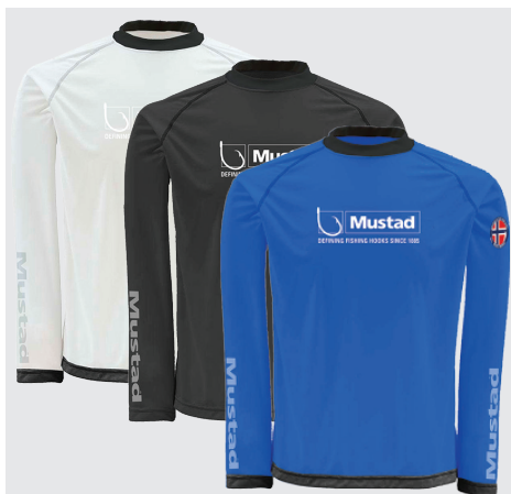
MCTS01 DAY PERFECT SHIRT

The Mustad Apparel range offers comfort and awesome looks on the water! The Day Perfects Shirts are technical next-to-skin shirts with effective moisture wicking. This keeps you dry and comfortable. They shirts also has UPF30 sun protecting. Our hoodies offer soft cotten and comfort. All at very reasonable prices.