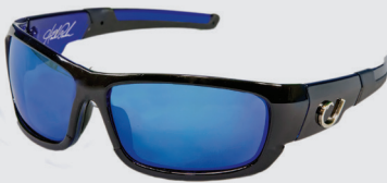
BLACK FRAME, SMOKE LENS WITH BLUE REVO HP101A-1