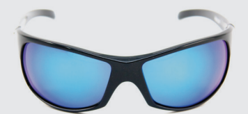
GLOSS BLACK FRAME / SMOKE BLUE REVO LENS HP103A-1