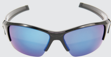
GLOSS BLACK FRAME / SMOKE BLUE REVO LENS HP105A-1