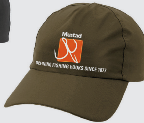
Brown REF. MCAP01-BR