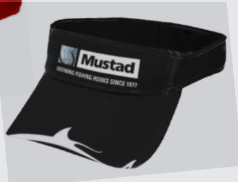
Tarpon REF. MCAP03-BL