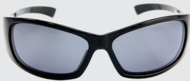
GLOSS BLACK FRAME / SMOKE LENS HP104A-2