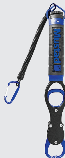
ALUMINIUM LIP GRIP W/SCALE - MT021

This 4" bait knife is constructed with high quality materials. The blade is made with high grade German stainless steel that is coated with DuPont™ Teflon® which adds corrosion resistance and allows the blade to slide effortlessly through the bait. The handle features an ergonomic comfort design with durable polypropylene with soft, no-slip grip.