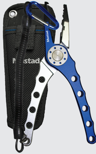
FEATHERWEIGHT ALUMINUM PLIER - MT026

Ultra light aluminium construction designed to cut braided fishing lines. With comfort in mind, the handles are molded of soft rubber. They also feature a sheath that the shears slide and lock into with an attached lanyard.