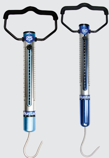
SALTWATER GRADE MECHANICAL SCALE 25LB - MT016

Highly accurate with stainless steel spring and hook. Body is lightweight and durable anodized aluminum. Sliding marker records weight after fish is removed from the scale. Easy-grip rubberized handle.