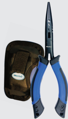
HEAVY-DUTY 8" PLIERS WITH SHEATH - MT010

Durable and functional, these pliers are built to perform. Constructed with stainless steel, the pliers are then coated with black titanium nitride for increased corrosion resistance. They feature textured jaws for a more secure hold, built-in crimper, split-ring tool, lure tuner grooves and a mono/wire cutter. They also feature durable, soft-grip handles for comfort and nylon sheath with Velcro closure and belt loop.