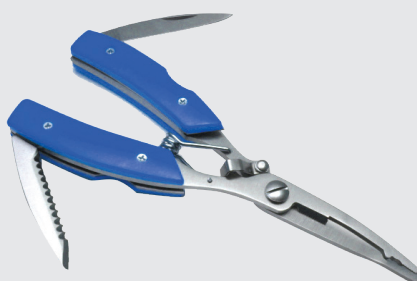
FINESSE MULTIPLIER - MT023

This filleting knife is constructed with high quality materials. The blade is made with high grade German stainless steel coated with DuPont™ Teflon® which adds corrosion resistance and allows the blade to slide effortlessly. The handle features an ergonomic comfort design with durable polypropylene with soft, no-slip grip.