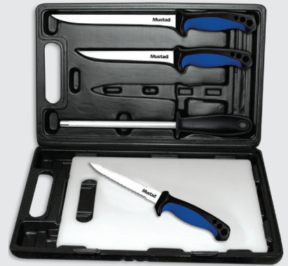
6 PIECE KNIFE SET - MT027

Lightweight and durable! Made from aircraft grade ultra-light aluminum that has been heavily anodized for greater corrosion resistance. Features coated stainless steel jaws and replaceable tungsten-carbide cutters.