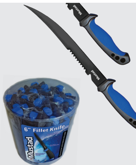
6" FILLET KNIFE 24 PC BUCKET - MT022

This fish gripper is constructed with a combination of aluminum and stainless steel for lighter weight and performance. Jaws open easily with the spring trigger and when released, fish are held firmly. Handle features soft-grip and spring scale goes to 50 pounds. Includes a lanyard.