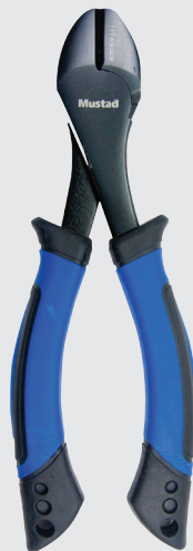
HEAVY-DUTY WIRE/ LINE CUTTERS - MT012

When dealing with toothy fish, you need longer pliers to stay safe. These extra-long reach pliers are constructed with stainless steel and then coated with black titanium nitride for increased corrosion resistance. They feature textured jaws for a more secure hold and durable, soft-grip handles for comfort.