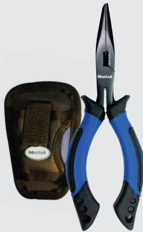
HEAVY-DUTY 6" PLIERS WITH SHEATH - MT009

Built with strength and weight in mind, these pliers are produced with high quality stainless steel and aluminum. Stainless steel coated with corrosion resistant rainbow Titanium. In order to reduce total weight, the handles are made with aircraft grade aluminum. These pliers also feature replaceable tungsten-carbide side cutters, a lanyard and durable rubber holster.