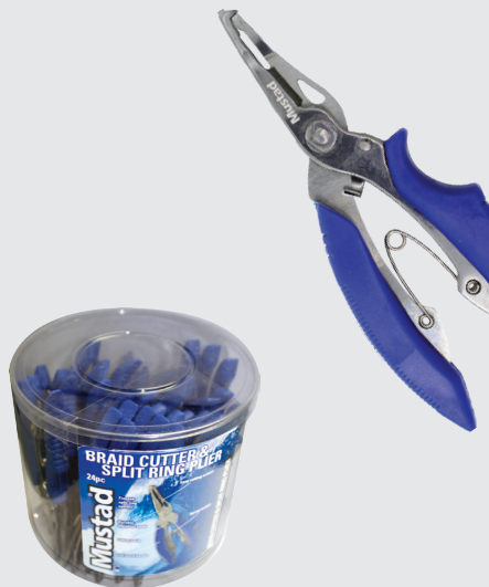
BRAID CUTTER & SPLIT RING PLIER 5" 24 PCS BUCKET - MT029

Durable stainless steel Finesse split ring opener. Soft touch handle, easy cutting scissors, spring-loaded & Safety latch.