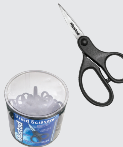
BRAID SCISSORS 24PC BUCKET - MT024

Multi-function pliers in stainless steel. Excellent line cutter for wire and mono lines. Split rings and hook removal. Two built-in-knives.