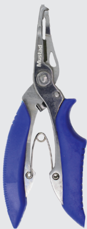
BRAID CUTTER & SPLIT RING PLIER 5" - MT028

Durable stainless steel Finesse split ring opener. Soft touch handle, easy cutting scissors, spring-loaded & Safety latch.