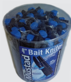
24 PC BUCKET 4" BAIT KNIFE - MT020

Highly accurate with stainless steel spring and hook. Body is lightweight and durable anodized aluminum. Sliding marker records weight after fish is removed from the scale. Easy-grip rubberized handle.