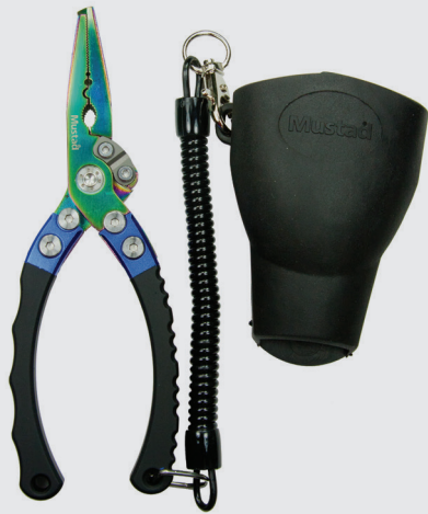
6.5" HYBRID PLIERS - MT007

Built with strength and weight in mind, these pliers are produced with high quality stainless steel and aluminum. Stainless steel coated with corrosion resistant rainbow Titanium. In order to reduce total weight, the handles are made with aircraft grade aluminum. These pliers also feature replaceable tungsten-carbide side cutters, a lanyard and durable rubber holster.