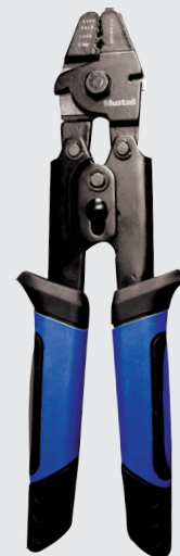
HEAVY-DUTY CRIMPER/CUTTER - MT013

Durable and functional, these cutters are built to perform. Constructed with stainless steel, the cutters are then coated with black titanium nitride for increased corrosion resistance. They feature hardened jaws for a longer cutting life. They also feature durable, soft-grip handles for comfort and nylon sheath with Velcro closure and belt loop.