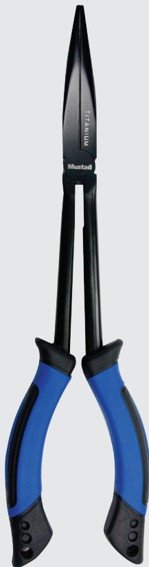
HEAVY-DUTY 11" LONG REACH PLIERS - MT011

Durable and functional, these pliers are built to perform. Constructed with stainless steel, the pliers are then coated with black titanium nitride for increased corrosion resistance. They feature textured jaws for a more secure hold, built-in crimper, lure tuner grooves and a mono/wire cutter. They also feature durable, soft-grip handles for comfort and nylon sheath with Velcro closure and belt loop.