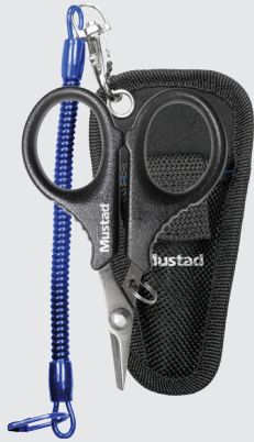
MICRO BRAID SCISSOR - MT025

Ultra light aluminium construction designed to cut braided fishing lines. With comfort in mind, the handles are molded of soft rubber. They also feature a sheath that the shears slide and lock into with an attached lanyard.