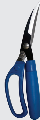
BAIT SCISSOR - MT030

24 Pcs bucket of durable stainless steel Finesse split ring plier 5". Soft touch handle, easy cutting scissors, spring-loaded & Safety latch.